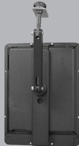
Tablet Mount (back)