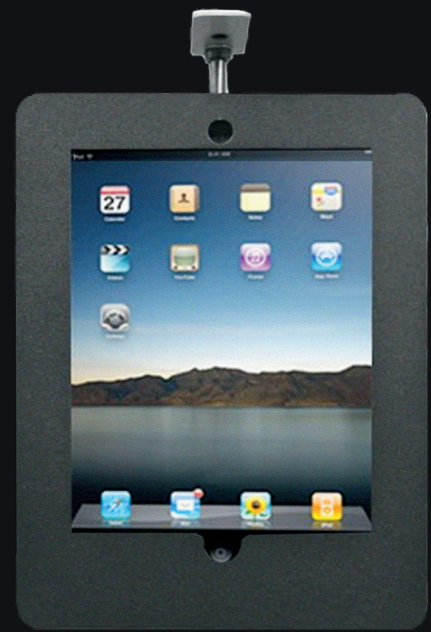
Tablet Mount (front)

A complete solution brought to you by the nation's oldest engineering design and manufacturing company providing complete healthcare-grade TV swing arm solutions since 1980... PDi.