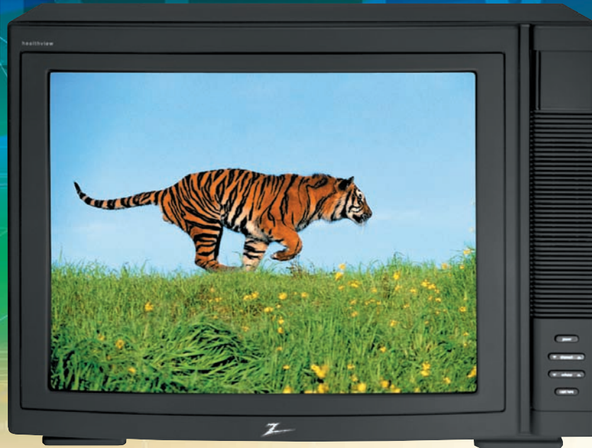
20" Remote Control Color TV H20J54DT